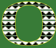
Native American Student Union