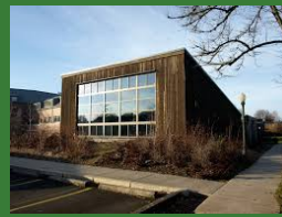
Many Nations Longhouse