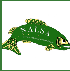
Native American Law Student Association