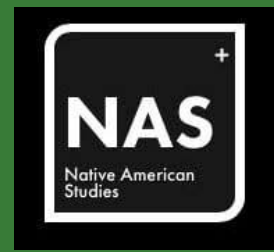
Native American Studies