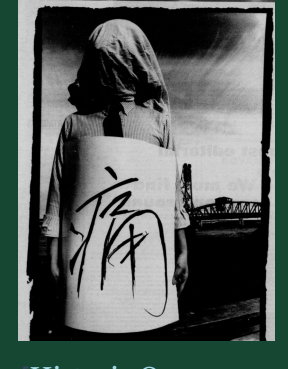
Historic Oregon Newspapers: Asian Activists Challenge Double Myth of Invisibility Just Out, 1991.

Around the O: Honoring Asian Pacific Island American Month in new ways APANO (Asian Pacific American Network of Oregon) Resource Hub.