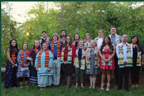
Native American Graduation Ceremony. May 31, 2019