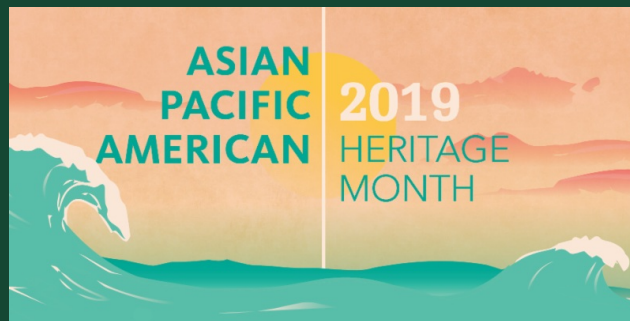
Hui 'O Hawai'i 44th Annual Lū'au. May 2019