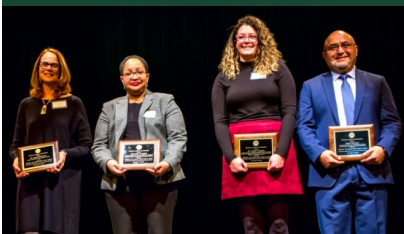
MLK Awards Ceremony and Luncheon