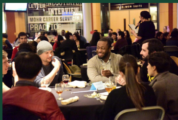
CODAC: Creating Connections