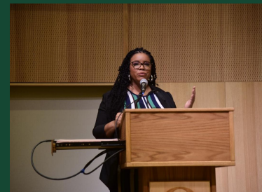
BE Series: April Reign #OscarsSoWhite