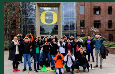
DEI Mardi Gras Celebration